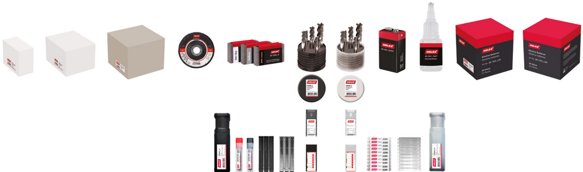
Current state of HOLEX packaging

(e.g. boxes with blister packaging) or if safety instructions must be applied, the packaging must be compliant with the HOLEX design standard.