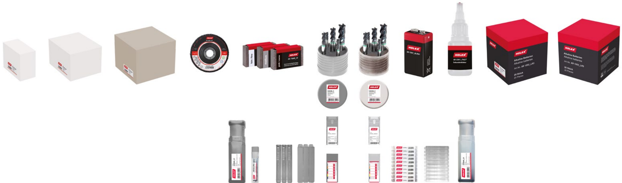
Current state of HOLEX packaging

(e.g. boxes with blister packaging) or if safety instructions must be applied, the packaging must be compliant with the HOLEX design standard.